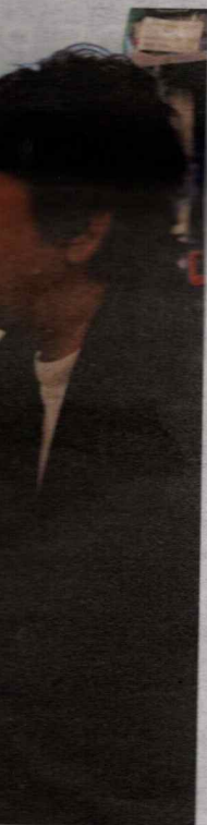
ing with help from to school next year.

"It was amazing and it's really lovely that the younger generation are engaged and aware and care," she said. "I think it's awesome."