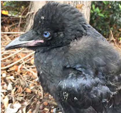
Leaving the nest